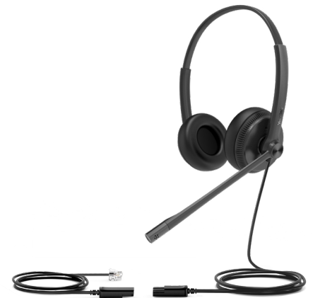
YHS34/YHS34 Lite Dual