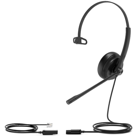
YHS34/YHS34 Lite Mono

Built for comfort with soft ear cushions and ultra-lightweight materials, the YHS34/YHS34 Lite is 10%~30% lighter than other headsets in the same range. Its ergonomic design makes this headset comfortable enough for long conference calls and all day use.